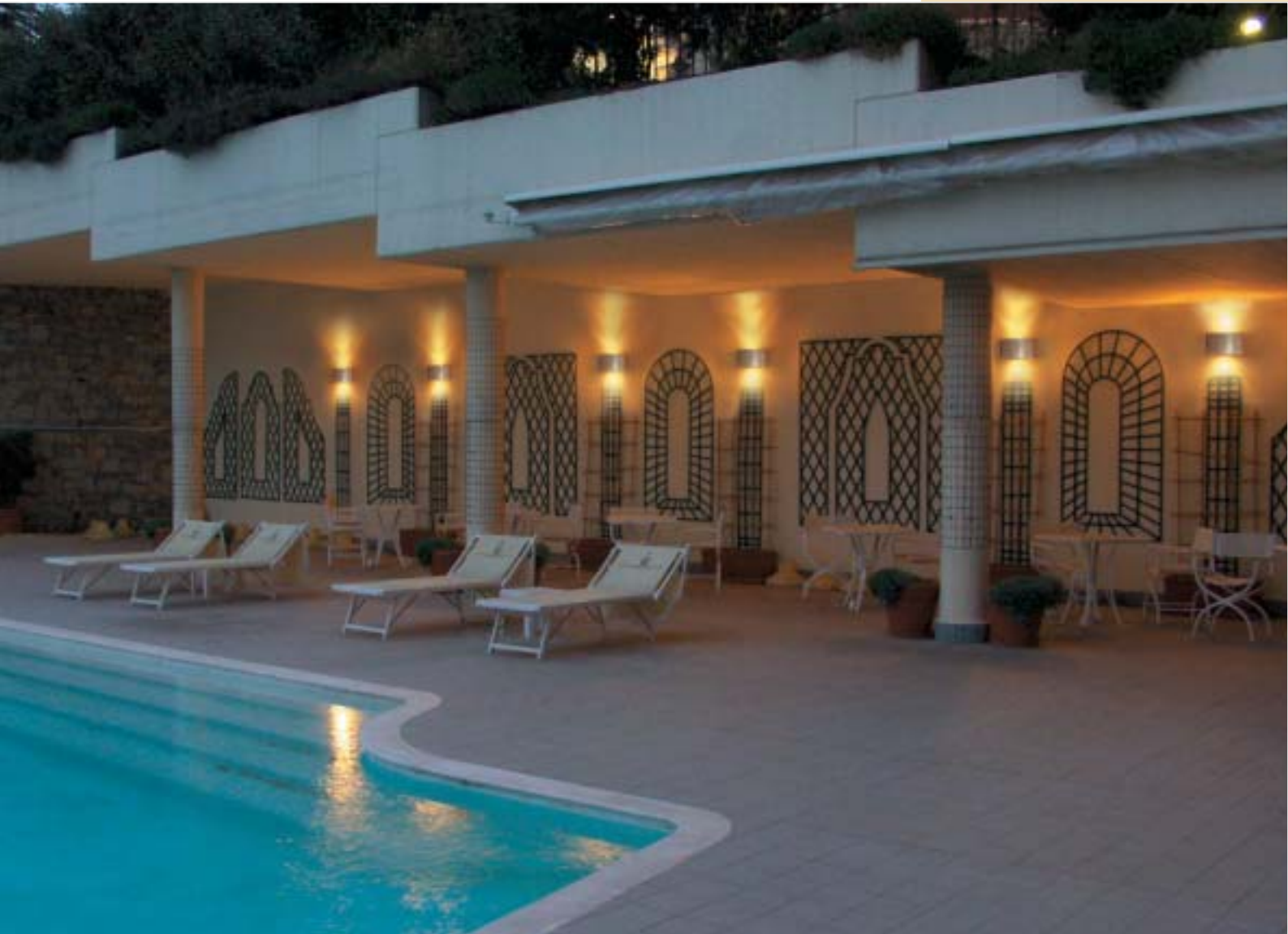
EXCELSIOR PALACE HOTEL - Portofino Coast - Outdoor pool