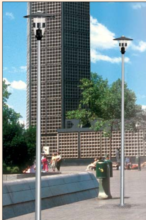
Post SAL-4,5-B/60 Lighting fitting OPC-1 Light bowl Auris with a cap