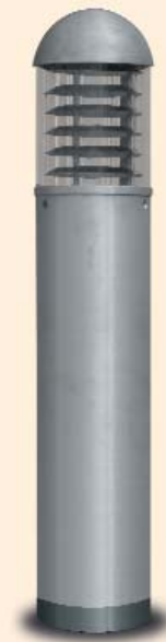
SAP 900 dz