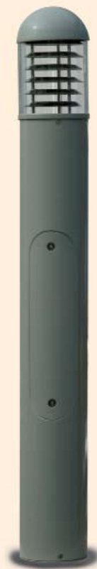
SAP 1200 W